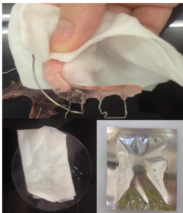
Figure 2 An example of retainer cleansing products in form of wet wipe