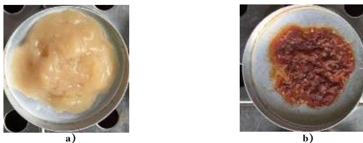
Figure 2 Kluai Namwa pectin extracted; (a) Before drying (b) After drying