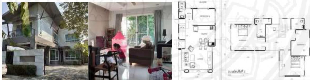
Figure 6 Detached House 6