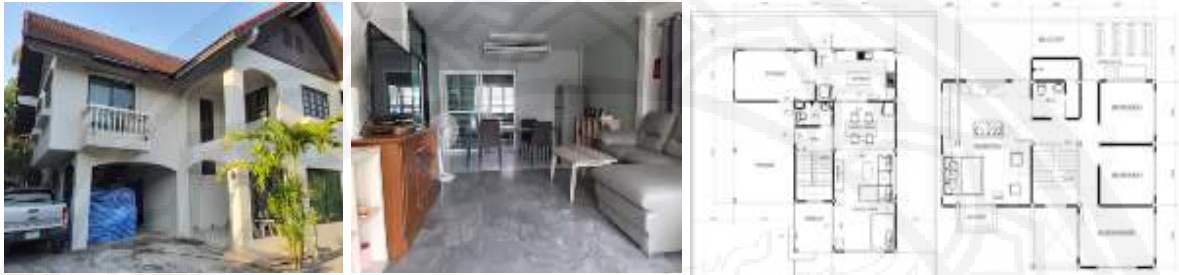
Figure 1 Detached House 1