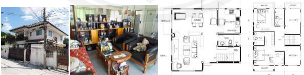
Figure 7 Detached House 7