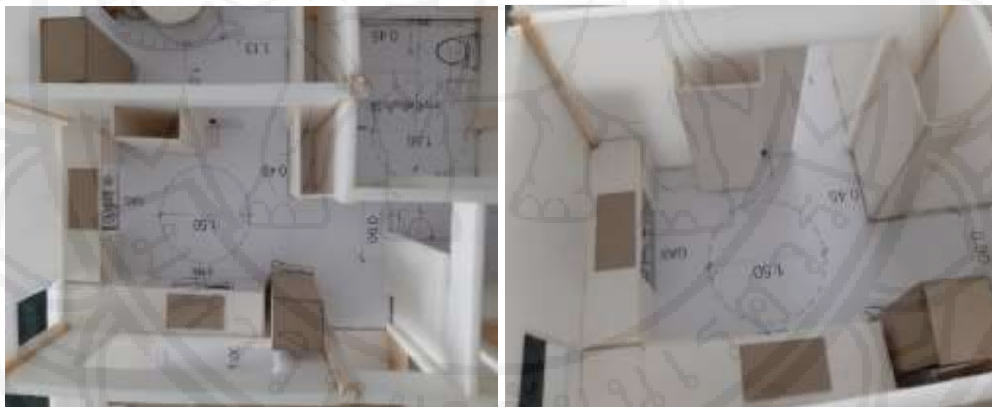
Figure 8 A model showing the kitchen area