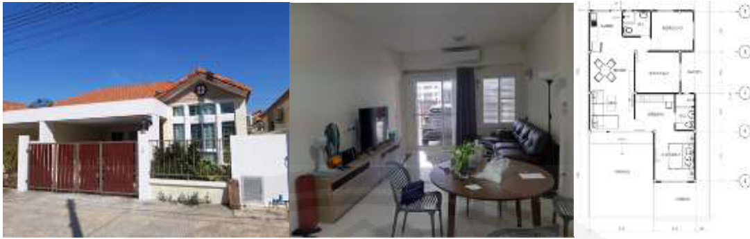
Figure 4 Detached House 4