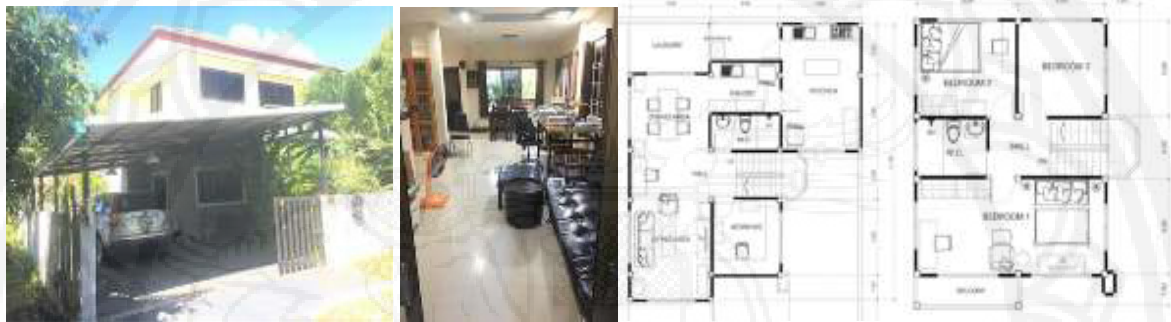
Figure 5 Detached House 5