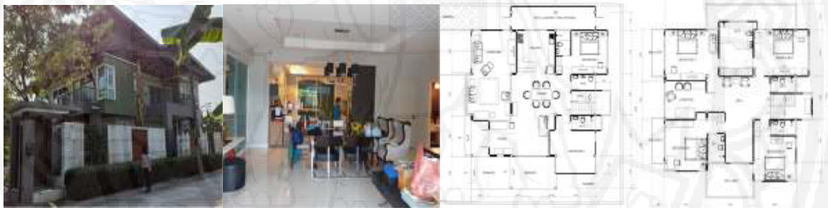
Figure 2 Detached House 2