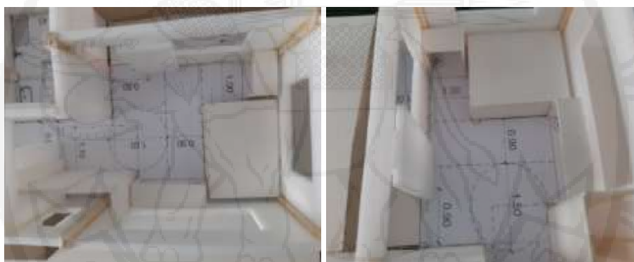
Figure 9 A model presenting the bedroom area

(3) Bathroom: there are many details in designing a bathroom for wheelchair users. The following elements need to be taken into consideration.