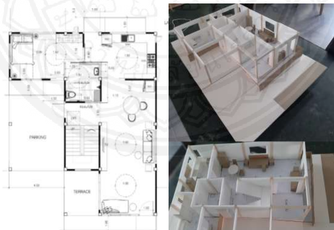
Figure 12 A layout and renovation model of wheelchair-accessible house

Apart from the above design criteria, the researcher also created a model of wheelchair-accessible house in order to make the informants clearly understand all design details during the data collection process. This model shows how to renovate an existing house into a wheelchair-accessible house and also compare the renovated areas with the existing ones. Thus, this model can make interested persons better understand the characteristics of wheelchair-accessible houses.