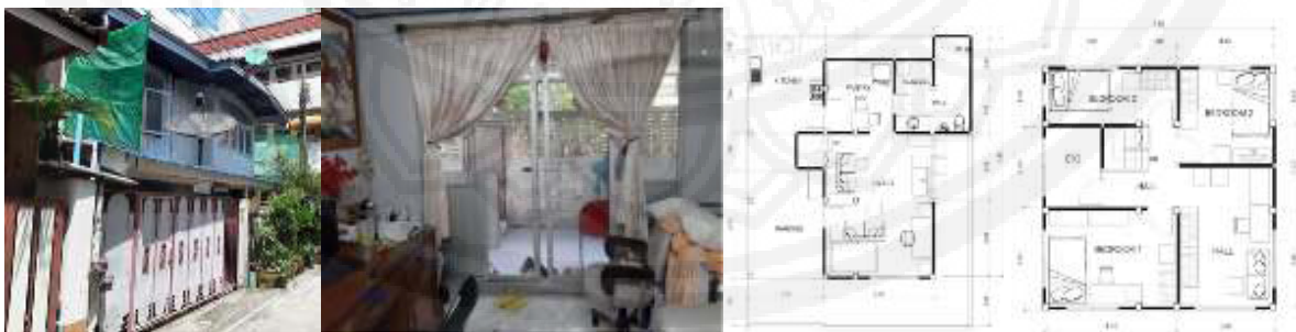
Figure 3 Detached House 3